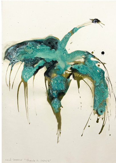
PHOENIX DU 27 OCTOBRE, 2021

Solution based on oxidized iron and bronze on arches paper