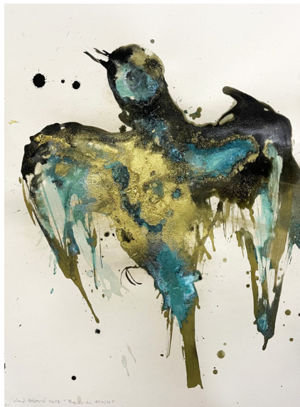
PHOENIX DU 10 OCTOBRE, 2021

Solution based on oxidized iron and bronze on arches paper 80 x 60 cm