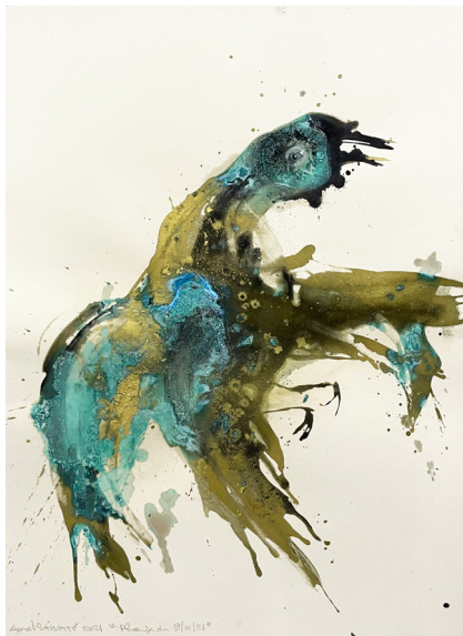
PHOENIX DU 18 OCTOBRE, 2021

Solution based on oxidized iron and bronze on arches paper