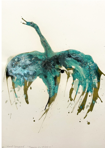
PHOENIX DU 23 OCTOBRE I, 2021