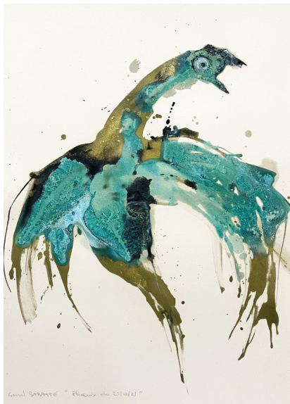
PHOENIX DU 23 OCTOBRE II, 2021 Solution based on oxidized iron and bronze on arches paper 80 x 60 cm