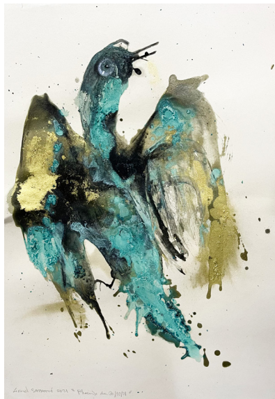
PHOENIX DU 20 OCTOBRE, 2021

Solution based on oxidized iron and bronze on arches paper 80 x 60 cm