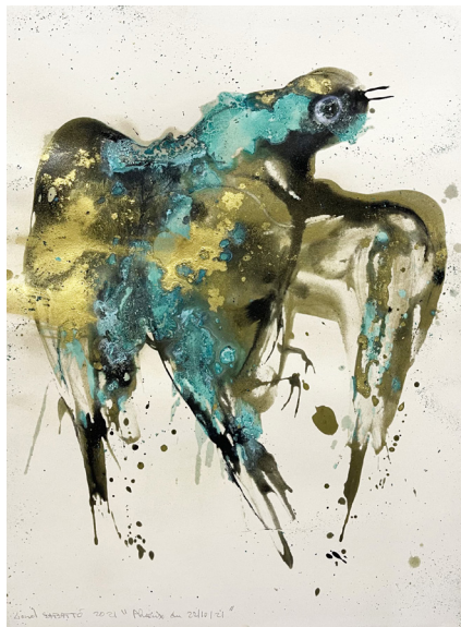
PHOENIX DU 22 OCTOBRE, 2021

Solution based on oxidized iron and bronze on arches paper 80 x 60 cm