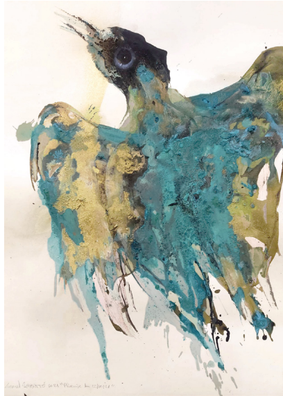
PHOENIX DU 12 OCTOBRE, 2021 Solution based on oxidized iron and bronze on arches paper 80 x 60 cm