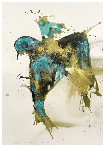
PHOENIX DU 13 OCTOBRE, 2021

Solution based on oxidized iron and bronze on arches paper