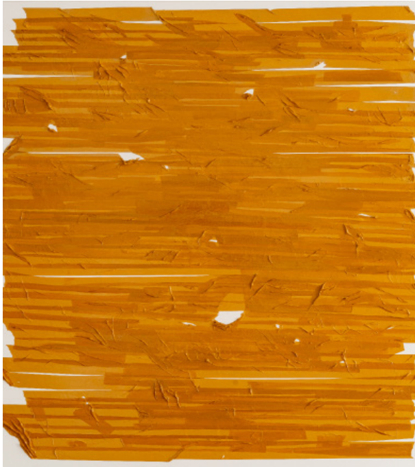
Grand TP, 2022