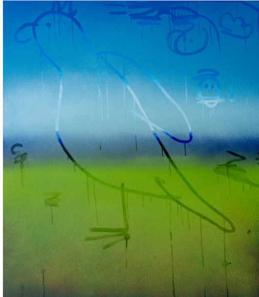
WP, 2022 Oil on canvas 100 x 90 cm