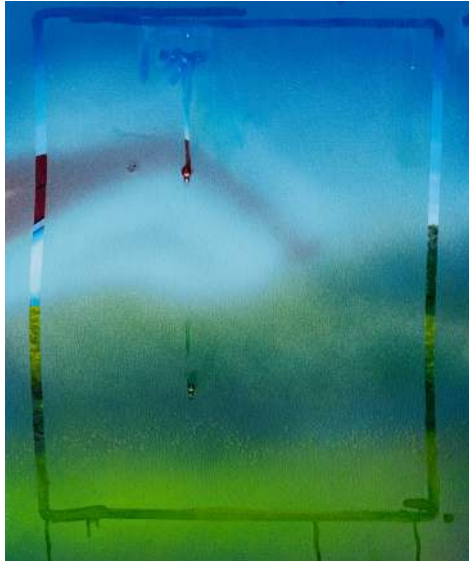
WP (Void), 2022 Oil on canvas 60 x 50 cm