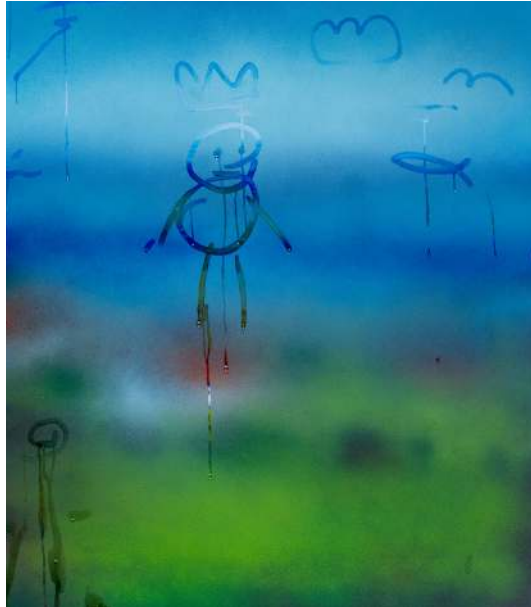
WP, 2022 Oil on canvas 100 x 90 cm