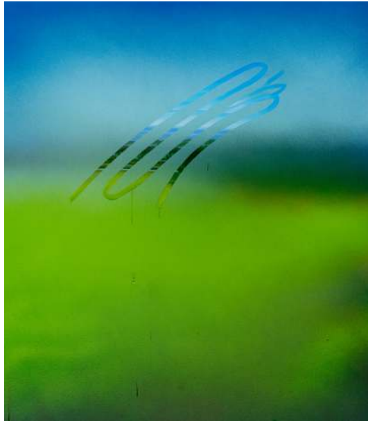
WP, 2022 Oil on canvas 100 x 90 cm