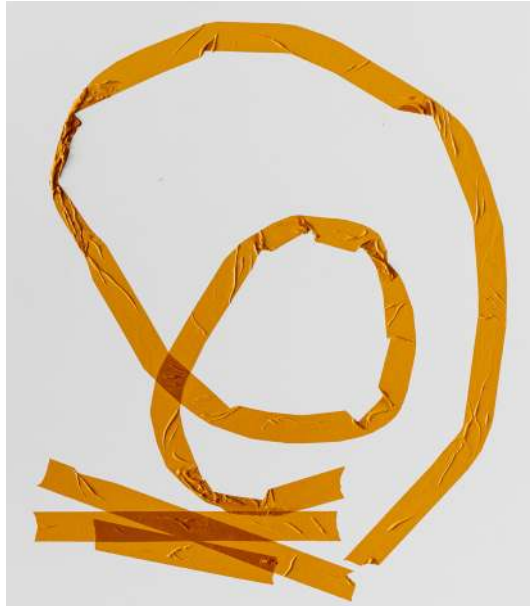
TP, 2022 Oil on canvas 100 x 90 cm