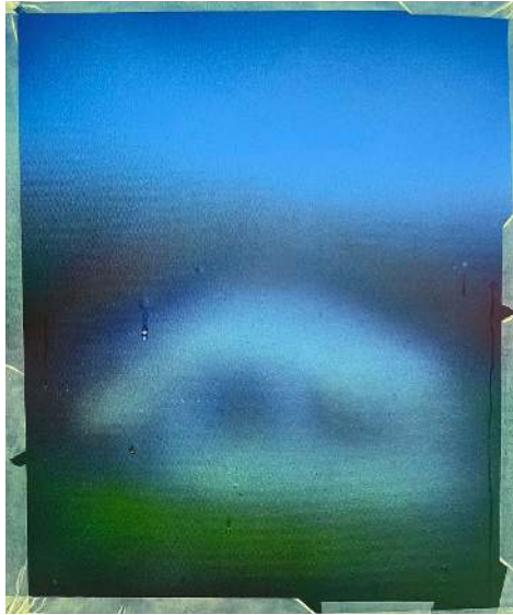
WTFP, 2022 Oil on canvas 60 x 50 cm