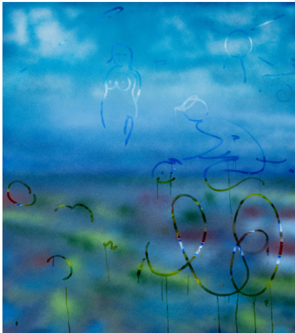
WP, 2022 Oil on canvas 160 x 130 cm