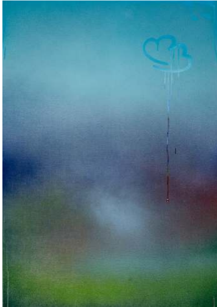
WP, 2022 Oil on canvas 70 x 50 cm