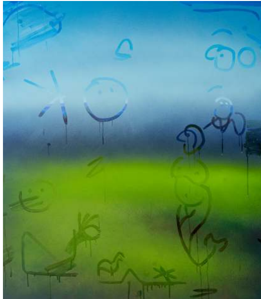
WP, 2022 Oil on canvas 100 x 90 cm