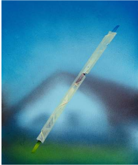
WTP (Cut), 2022 Oil on canvas 60 x 50 cm