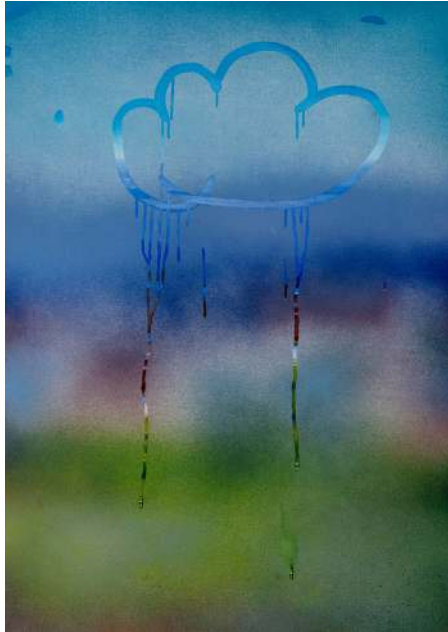
WF, 2022 Oil on canvas 70 x 50 cm