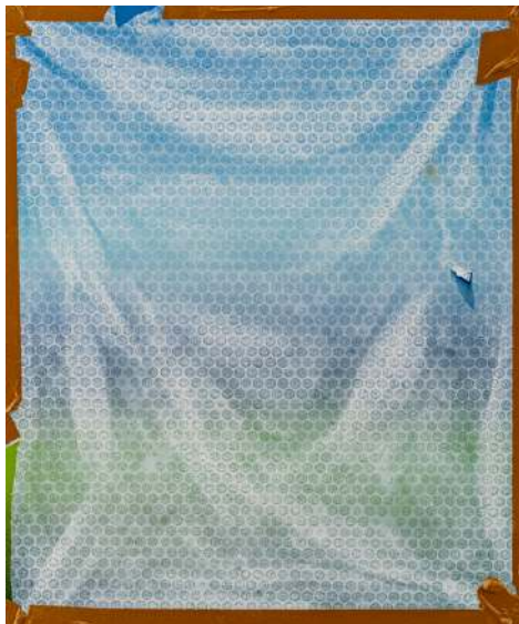
WFTP, 2022 Oil on canvas 60 x 50 cm