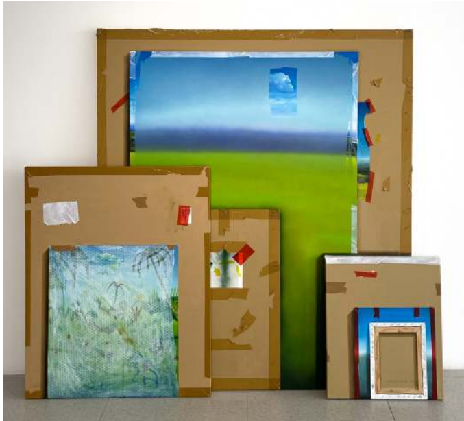
WF (SG Triptych IX), 2022 Oil on canvas Approx. 160 x 182 x 20 cm, Three Parts