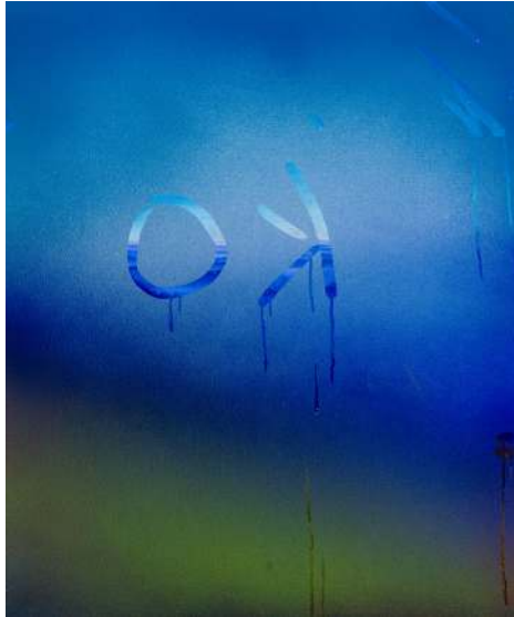
WF, 2022 Oil on canvas 60 x 50 cm