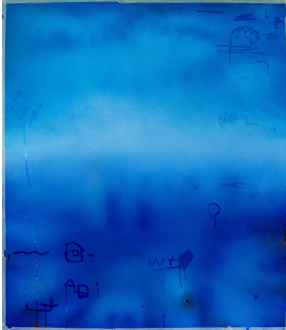
WTP, 2022 Oil on canvas 160 x 130 cm